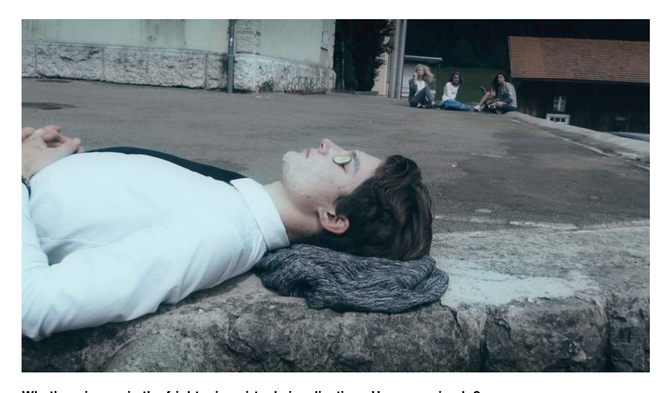
What's going on in the frightening virtual visualisation «Horror» episode?

Shot on Locations in La Chaux-du-Milieu, Valée de la Brévine, Le Locle, Les Ponts-de-Martel, Fleurier, Travers, Môtiers und Comb